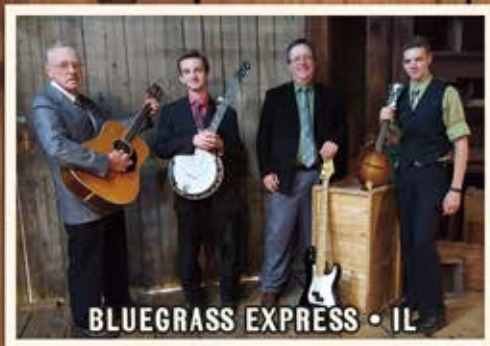
BLUEGRASS EXPRESS • IL

13TH ANNUAL | AUGUST 3-4-5, 2018 | STARTS FRIDAY 4PM | ENDS SUNDAY 1PM